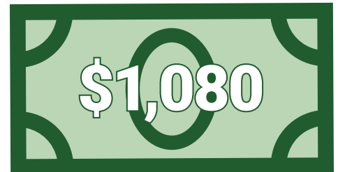
Average cost of an injury per employee