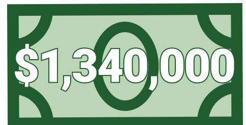
Average employer cost per fatality